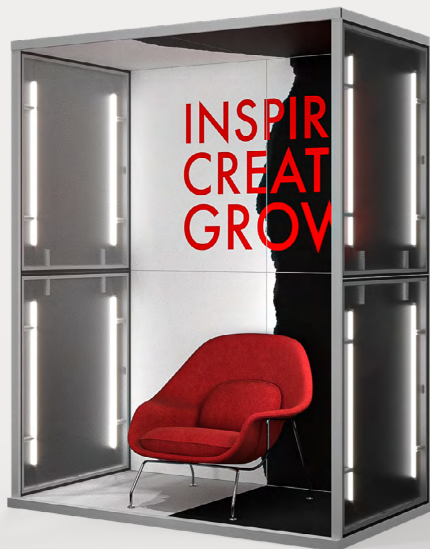
PHOTO ZONE 01