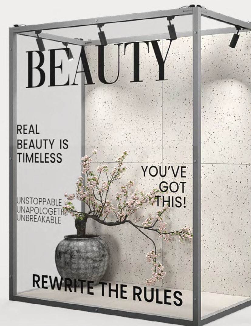
PHOTO ZONE 02